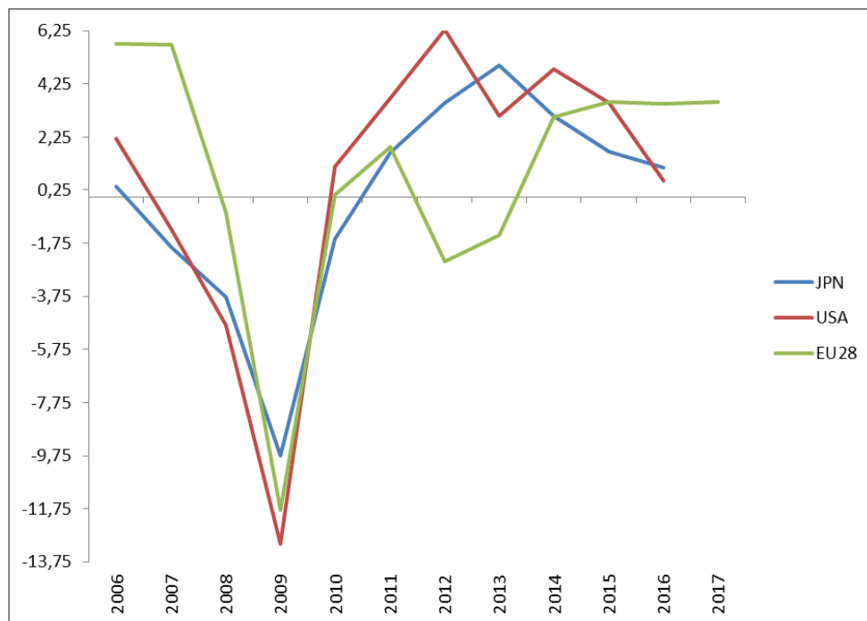
Figure 1 – Gross fixed capital formation average rate of growth, 2006-2017.